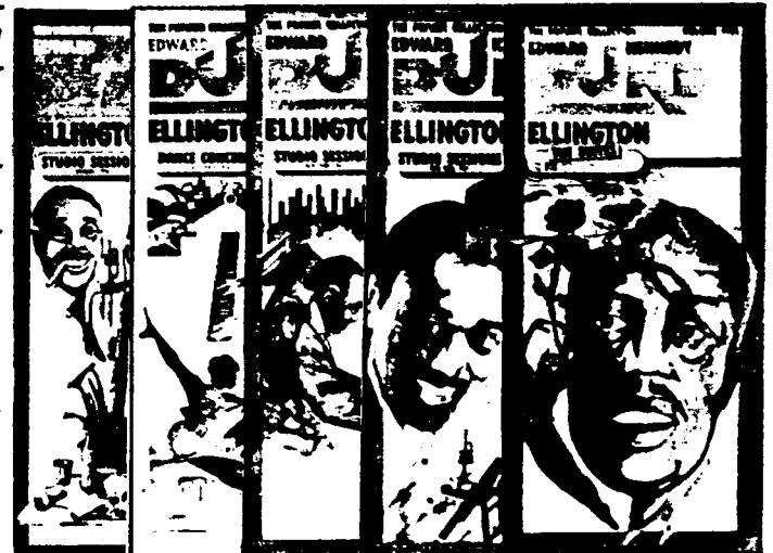
LMR CD 83000 LMR CD 83001 LMR CD 83002 LMR CD 83003 LMR CD 83004 (ctd. p.4) -