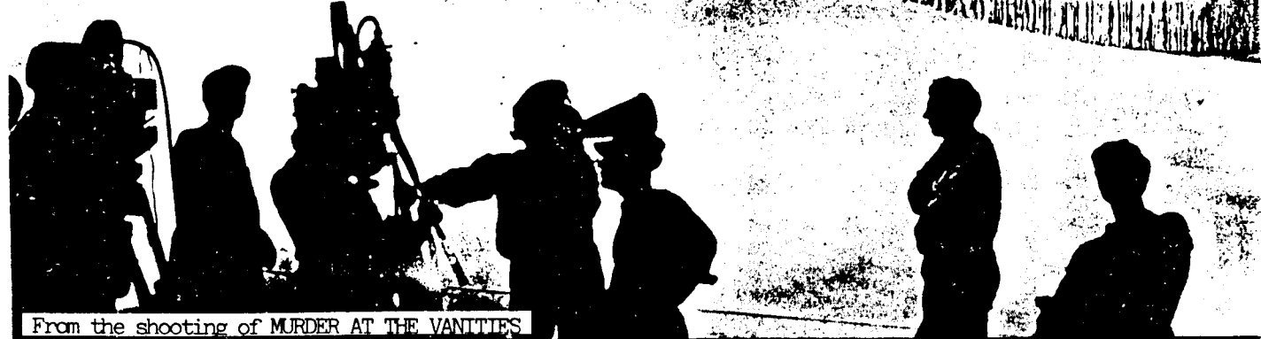
From the shooting of MURDER AT THE VANITIES