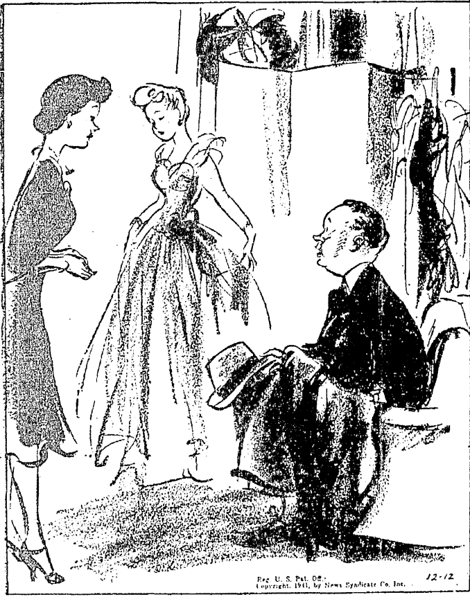
"The size doesn't make much difference. It's for my wife, but our daughter will talk it out of her anyway."