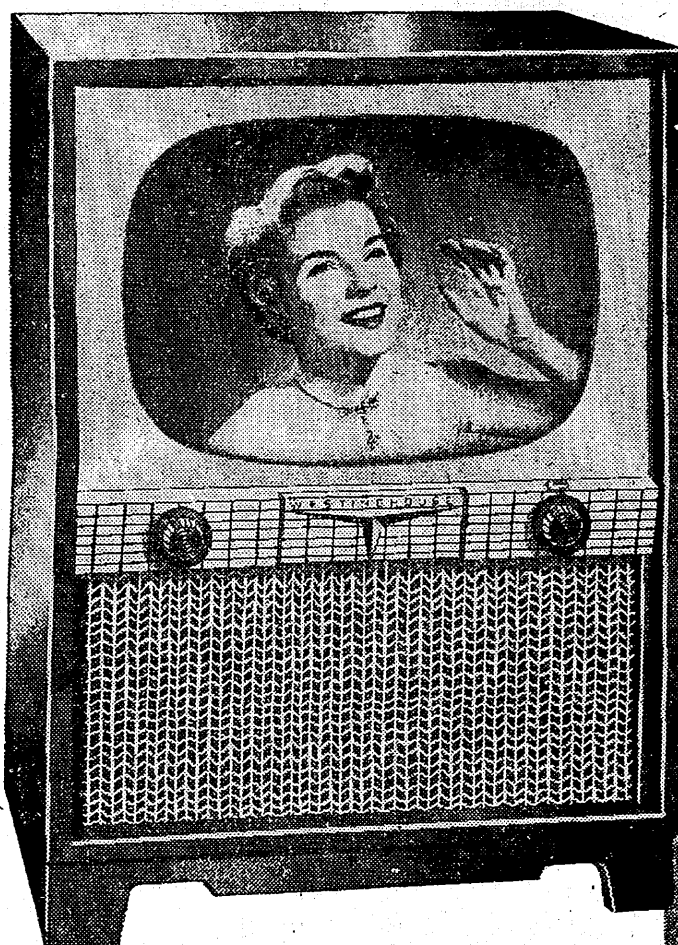
The Engleton, Model 830K21