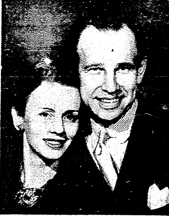
"Amazing versatility" is how west coast reviewers describe Jessica Tandy and Hume Cronyn (above) who will offer their dramatic variety show, "Face to Face," in the Beloit college fieldhouse Monday night.

The first two shows of the season, the Duke Ellington jazz concert and Bob Hope variety review, both played to capacity audiences. The series will close Feb. 5 with the Chicago Symphony orchestra, directed by Fritz Reiner.