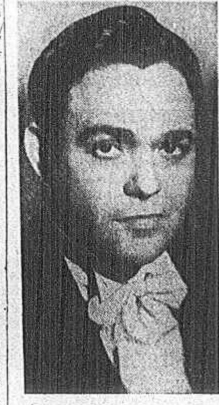
IN VERDI OPERA—James Melton will be heard as Alfredo in "La Traviata" on Wednesday night at the Metropolitan Opera House.